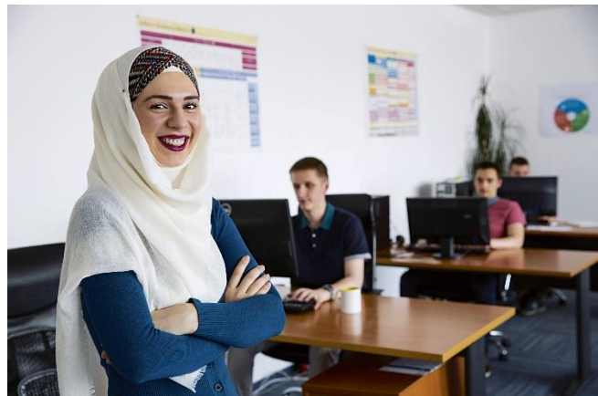
Continuing education in the IT sector.

The goal of MarketMakers is to contribute to increased employment and self-employment of young women and men in Bosnia and Herzegovina. The project achieves this by stimulating market systems to deliver services and to establish rules and regulations that work better for the private sector. The project also provides access to growth opportunities, investment, and thus an increased demand for labor. Helvetas works in IT and business process outsourcing, as well as the food industry and tourism sectors, to build a better environment for private enterprises in these industries to create jobs for young people; link up actors in the employment market; and remove legal or perceptual obstacles to sectoral development. Market Makers has so far helped to generate around 1,500 jobs for young people. Additionally, Helvetas has supported the creation of an association, which has grown to around 20 IT companies from across the country. The association, among other things, is investing in improving vocational and university education.