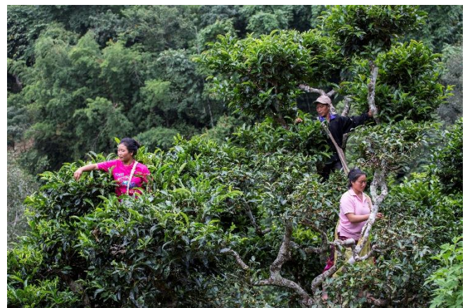
Tea growers in Laos.

Rural MEs will be supported toward commercial viability through the transfer of financial literacy and entrepreneurship skills, access to technologies, credit, and services, and economies of scale. The project will promote access to finance and dialogue in public fora on enabling environment issues that constrain ME growth. The project will leverage existing systems and resources, including partnering with GOL at the provincial and district levels to build their capacity to deliver enterprise training.